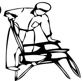
Position backrest for sitting