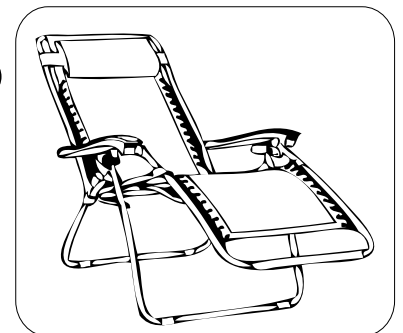
Congratulations! Setup of your new Naomi Home Zero Gravity Chair is Complete!