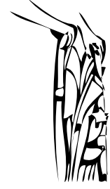
Gently pull the chair backrest away from the seat base to open the chair