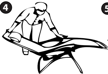
Lay the backrest all the way back