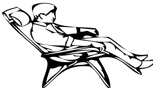
Tighten the adjustment tighteners to hold your position and enjoy.