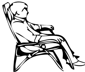
Sit in the chair