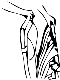
Place your hand on the chair backrest by the pillow and your other hand on the seat base near the adjustment tightener