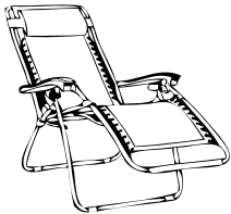
1 - Chair